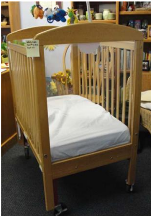
Generation 2 Worldwide SafetyCraft crib showing the clear plastic sides