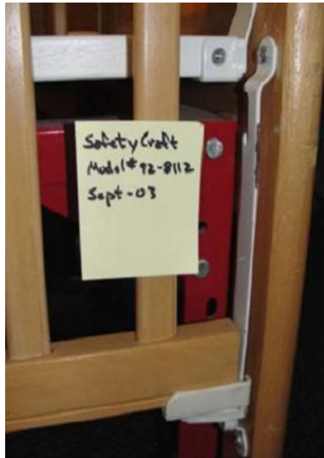
Generation 2 Worldwide SafetyCraft crib side view of the plastic drops-side hardware